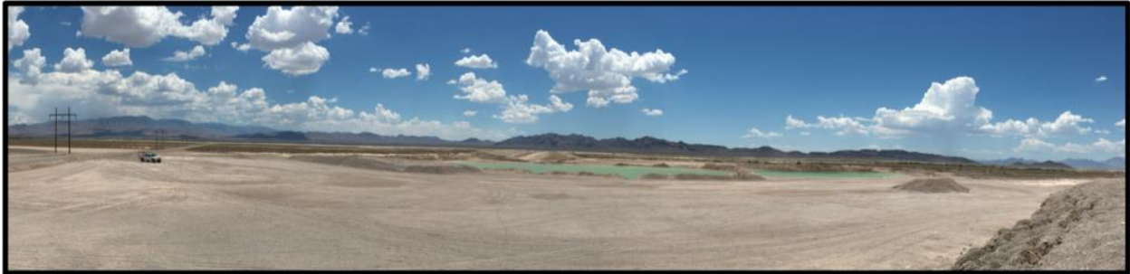
Caption: Amargosa Valley lithium exploration.

This report is part of a research project that describes the relationships between mines and railroads in the Mojave Desert and southwestern Great Basin. The collection can be accessed at http://www.greggwilkerson.com/railroads.html