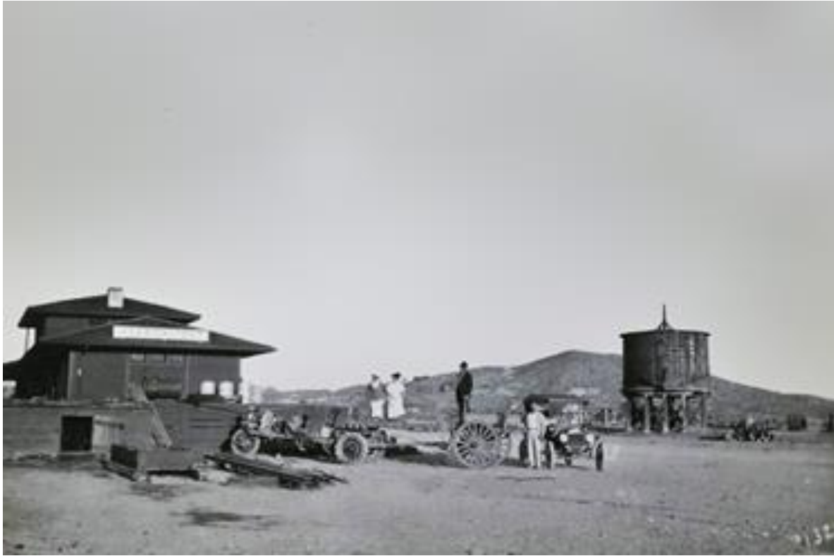
Barnwell and Searchlight train depot, 1920.