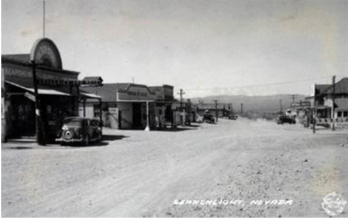
Caption. Searchlight 1930's.