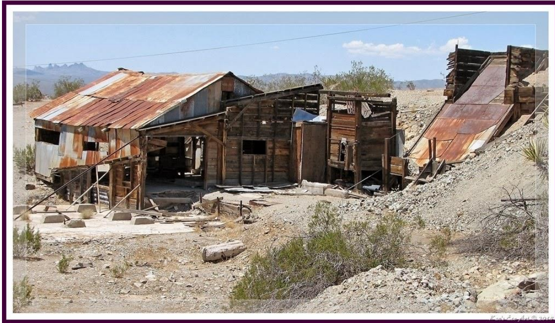
Caption: Ruins at Searchlight. From

These are described by Joseph (1985, Deposit 40), Wright and others (1953:185-187), Minobras (1973), and USBOM (1990:129). The B&S went past these mines and Coots Springs to BM 1387 .