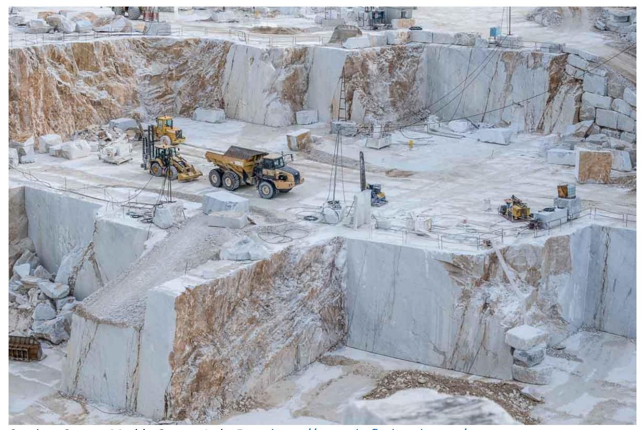
Caption: Carrera Marble Quarry, Italy.

In 1912 the American Carrara Marble Company was formed. The town of Carrara at a site near the LV&T was officially dedicated on May 8, 1913 and the mine railroad completed in 1914. The mine operated with what was then huge equipment capable of moving 15 ton blocks of marble. The mine operated from 1915 to 1916. There was a short rejuvenation of Carrera in 1927 by the T&T but it did not last either (Myrick, 1963:605-607).