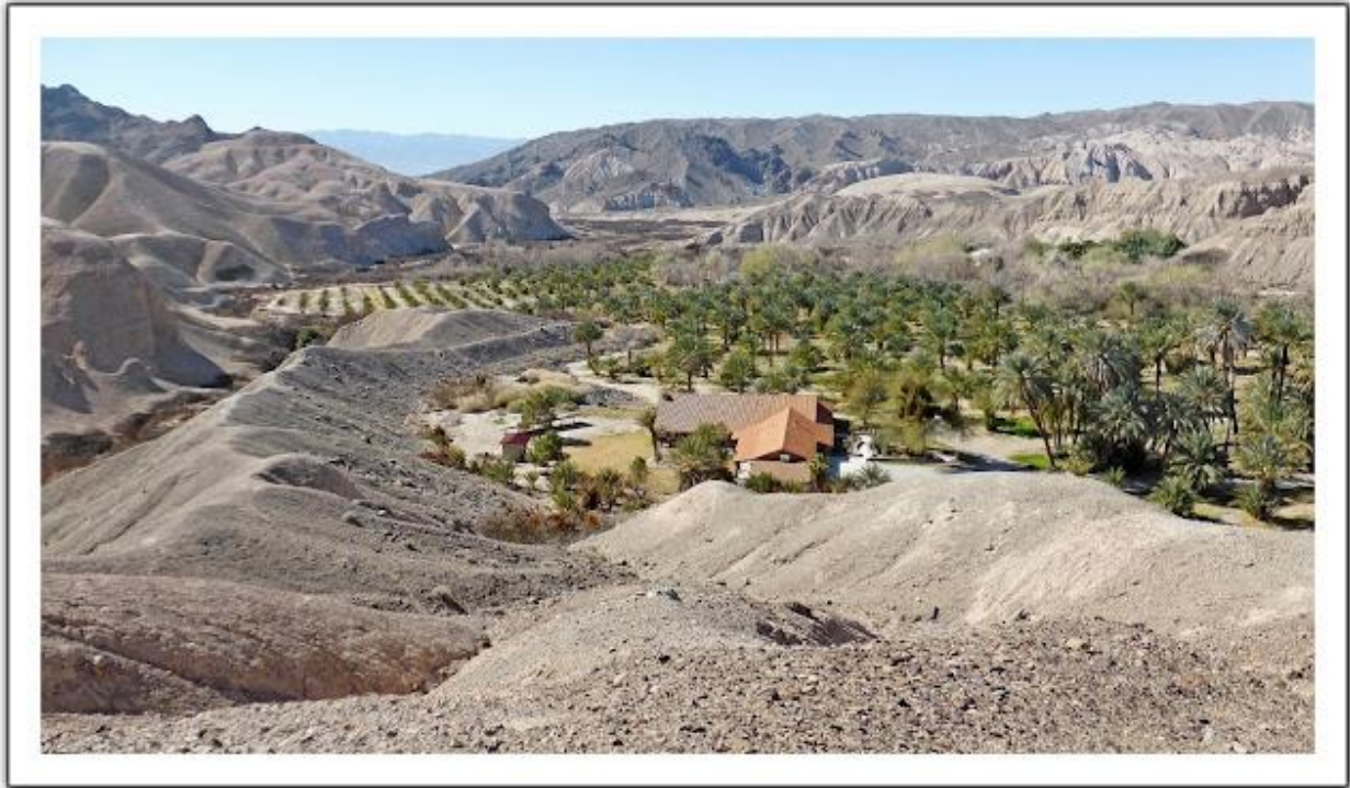
Caption: China Ranch Date Farm; From https://kensphotogallery.blogspot.com/2018/03/china-ranch-date-farm-trip-notes-for.html accessed Nov. 11, 2023.