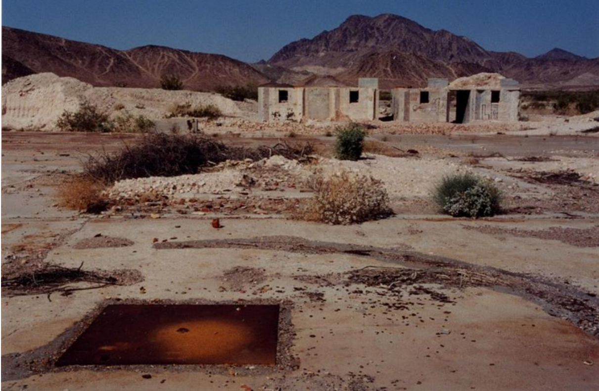
Caption: Foundations and scattered debris indicate the site of a major gypsum plant and community of 1,000, once located in this remote region 20 miles from the nearest settlement. U.S. Gypsum established the town and plant to process gypsum extracted from nearby mines in 1925, responding to a demand for a new product: drywall. After the mine shut down in 1966, the town was intentionally burned to the ground. U.S. Gypsum still manufactures over half of the nation's plaster products, and operates a major plant in Plaster City, California. From https://clui.org/ludb/site/midland accessed Jan. 15, 2023.