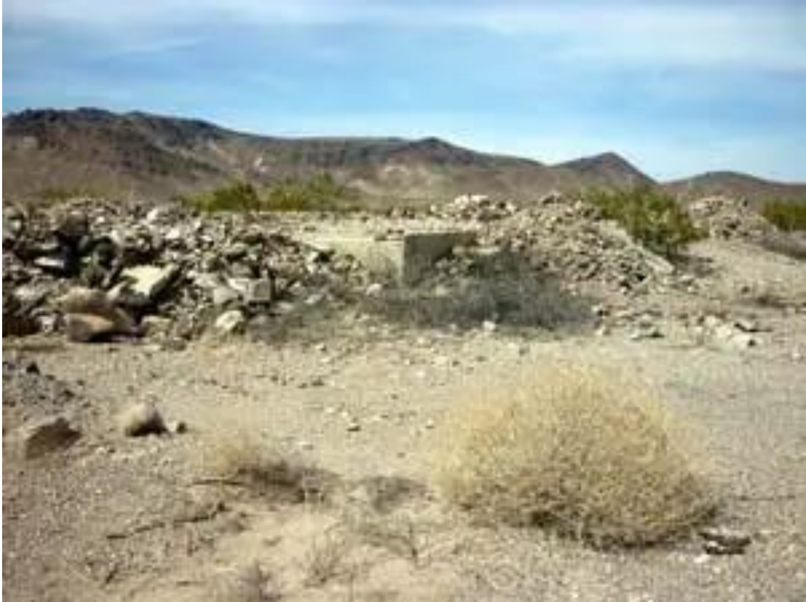
Caption: Brown Gypsum Mine plant foundations.