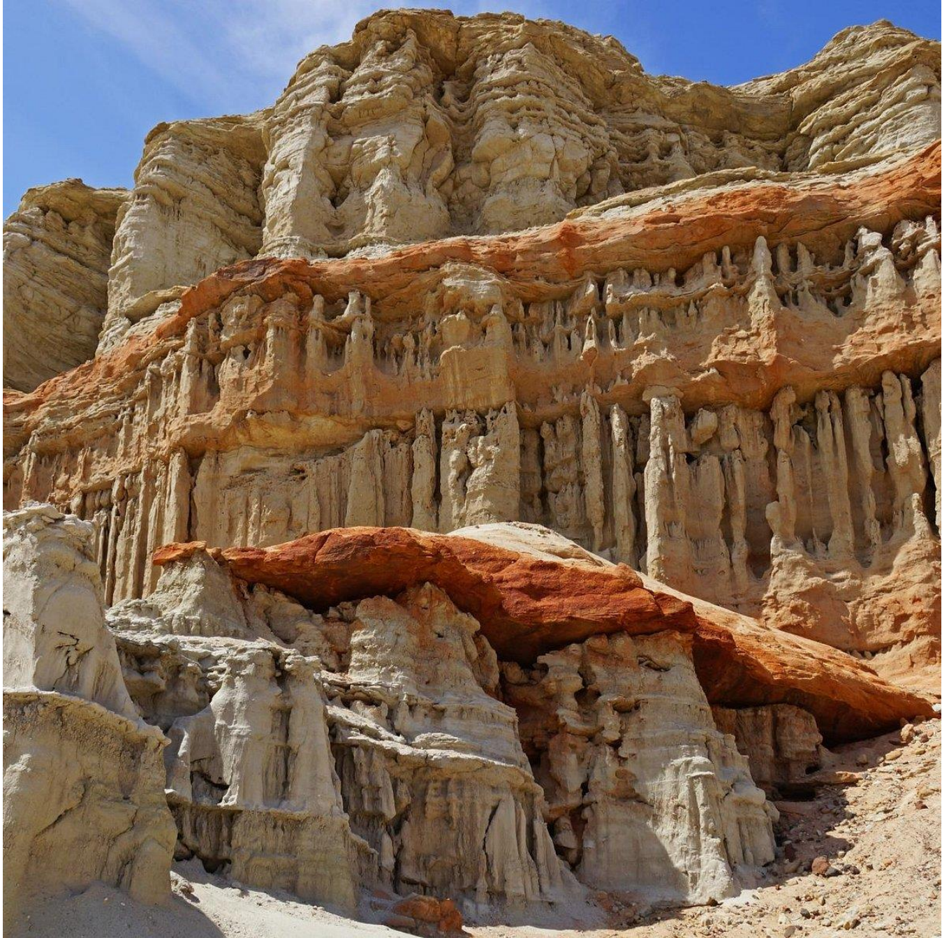
Caption: Red Rock Canyon State Park.