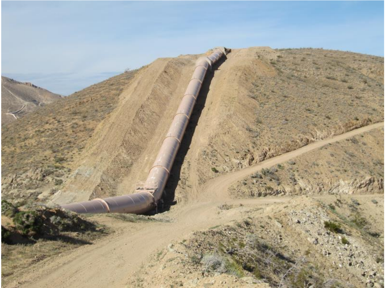
Caption: Los Angeles Aqueduct siphon at Red Rock Canon. From https://venturacountytrails.org/RecentPhotos/2015-03-25RedRockCynSP/IMG_0458_jpg.html accessed Feb. 11, 2024.