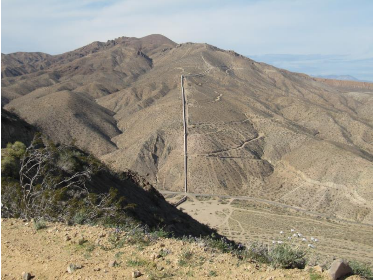
Caption: Los Angeles Aqueduct at Red Rock Canyon.